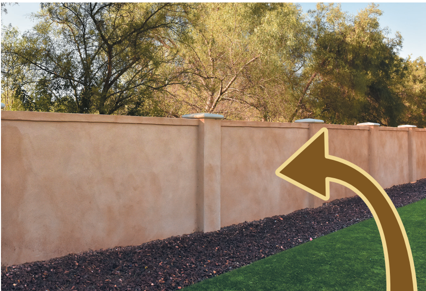
(exact wall locations vary)

Honor special fur friends by purchasing a personalized tile to be placed on the wall at “A Place for Paws” Dog Park.