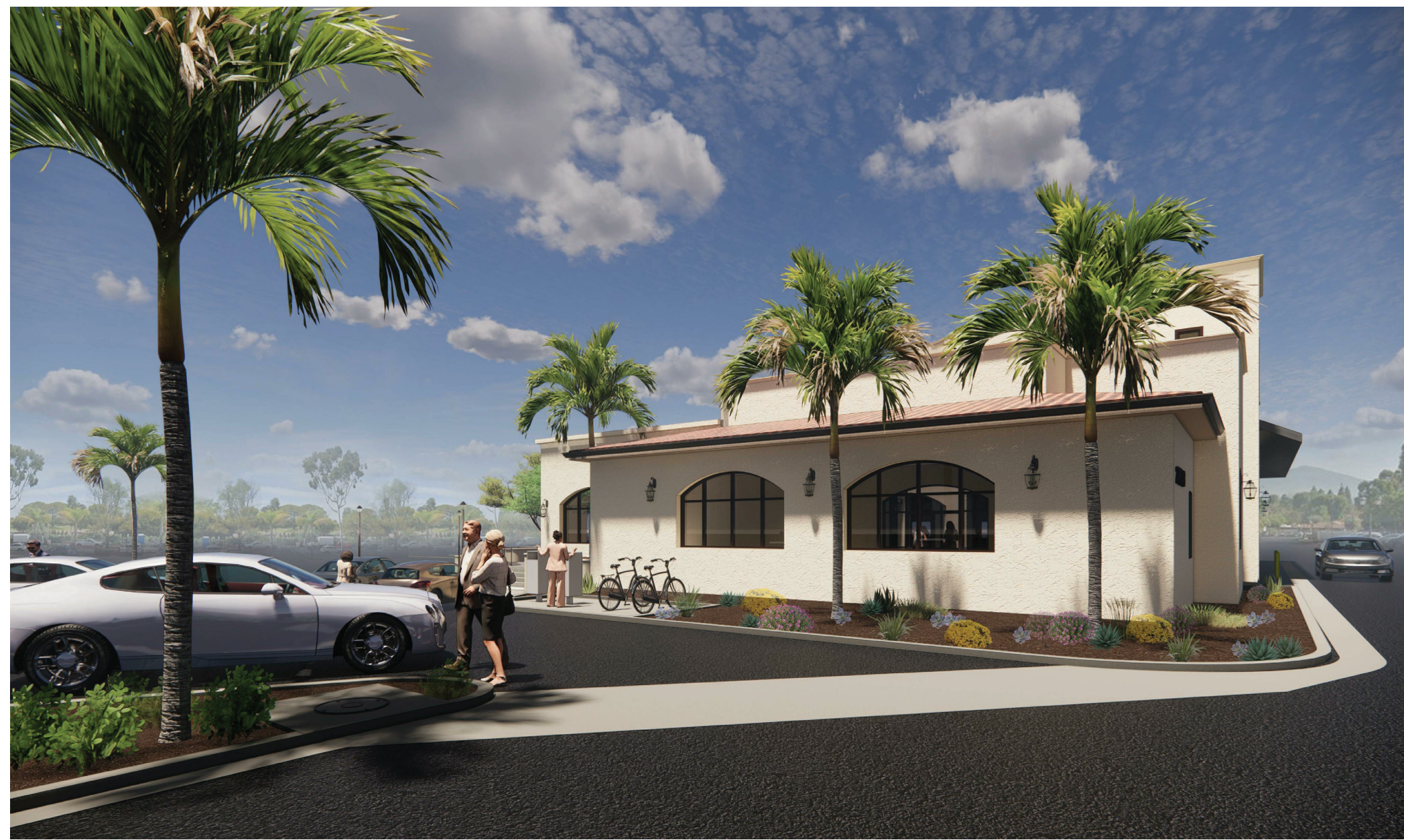
CITY HALL / PUBLIC LIBRARY PROJECT