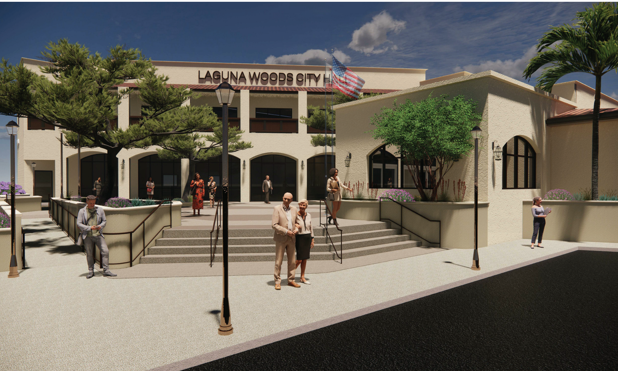
CITY HALL / PUBLIC LIBRARY PROJECT