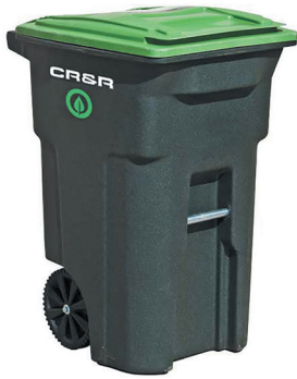
Green lid carts are for organic waste

Residents are encouraged to dispose of their organic waste in any of the green lid carts (“organic carts”) located throughout Laguna Woods Village.